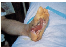
The results of poor foot care in uncontrolled diabetes.

Derma-Kure Cream promotes the debridement of necrotic tissue and assists in the removal of excess (fluid that leaks out of blood vessels into nearby tissues, also called pus). It supports granulation while protecting newly formed granulated tissue, thereby promoting efficient wound healing with fewer complications by maintaining a moist and stable wound environment. The formulation contains Calendula, which serves as a natural antiseptic to support healing and reduce the risk of infection. Calendula also helps diminish odour typically associated with deep, infected ulcers. Cantharis is included to alleviate burning and stinging sensations often experienced with extensive ulceration and wounds, particularly in areas with high nerve density. The remaining ingredients are homoeopathically blended to enhance granulation, accelerate tissue regeneration, and improve subcutaneous circulation.